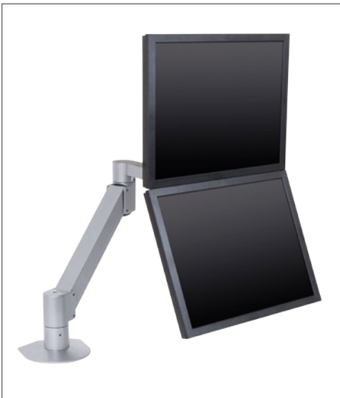
Rotate monitors from landscape to portrait