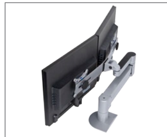
Arm collapses upon itself to save space